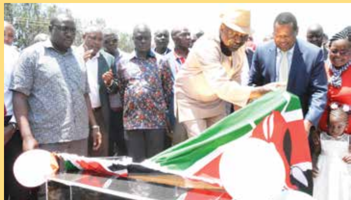
Former Prime Minister Rt. Hon. Raila Odinga commissions construction of the proposed KMTC Awendo Campus