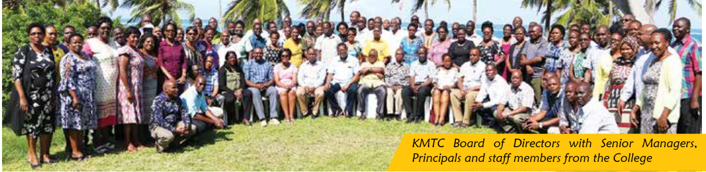
KMTC Board of Directors with Senior Managers, Principals and staff members from the College

An annual retreat to take stock of achievements and challenges registered in the College over the last year and plans for the coming financial year was held in Mombasa from 17 th - 21 st June, 2019.