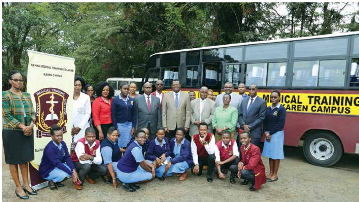
Board of Directors and Senior Managers from the College join Karen Campus staff and students to capture the moment for posterity