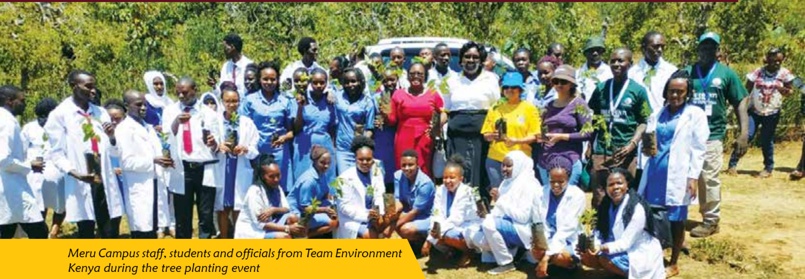
Meru Campus staff, students and officials from Team Environment Kenya during the tree planting event