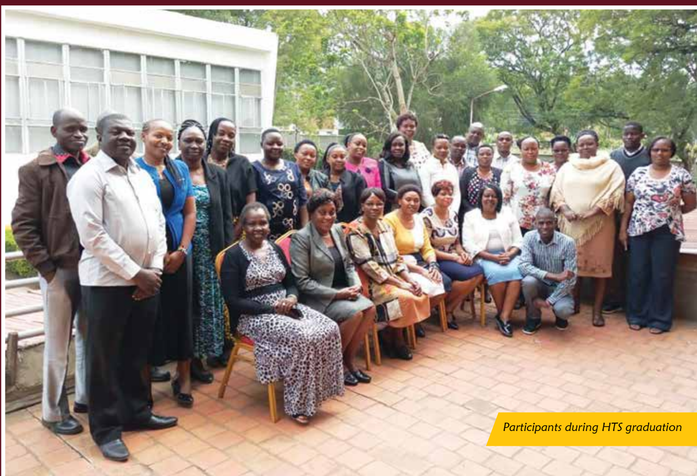
Participants during HTS graduation

Other short courses offered by the College include: Healthcare Entrepreneurship, Medical Engineering, Community Health Development, Safe Phlebotomy among others.