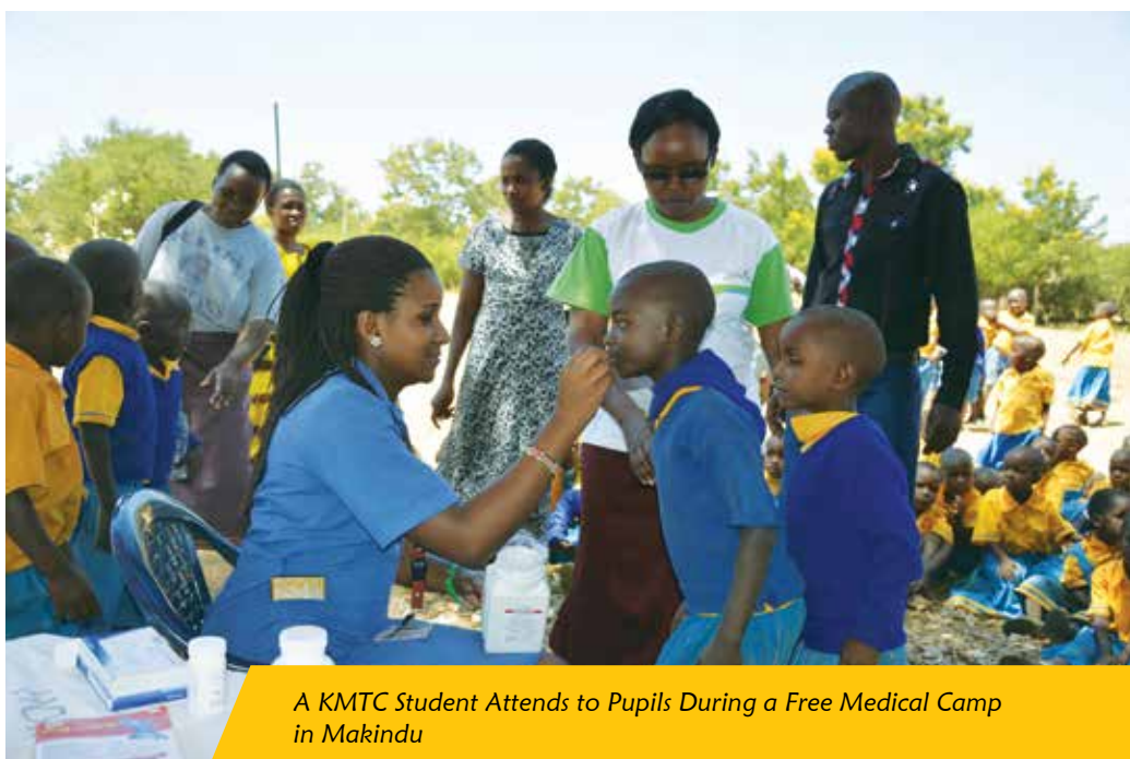
A KMTCC Student Attends to Pupils During a Free Medical Camp in Makindu