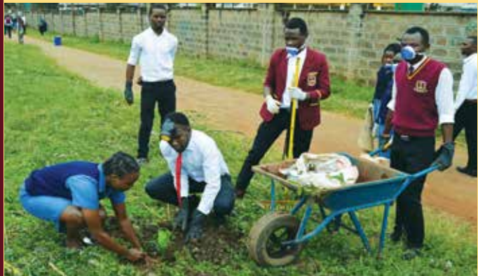
KMTC Students Take Part in Environmental Conservation Activities