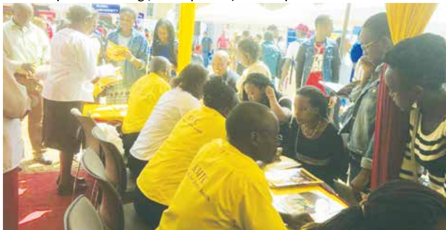
KMTC admissions office staff provide information on KMTC courses to visitors who flocked to the College stand

The open discussions session encouraged the youthful audience to ask questions concerning careers decision, career progression, internships and finding jobs especially in competitive markets.