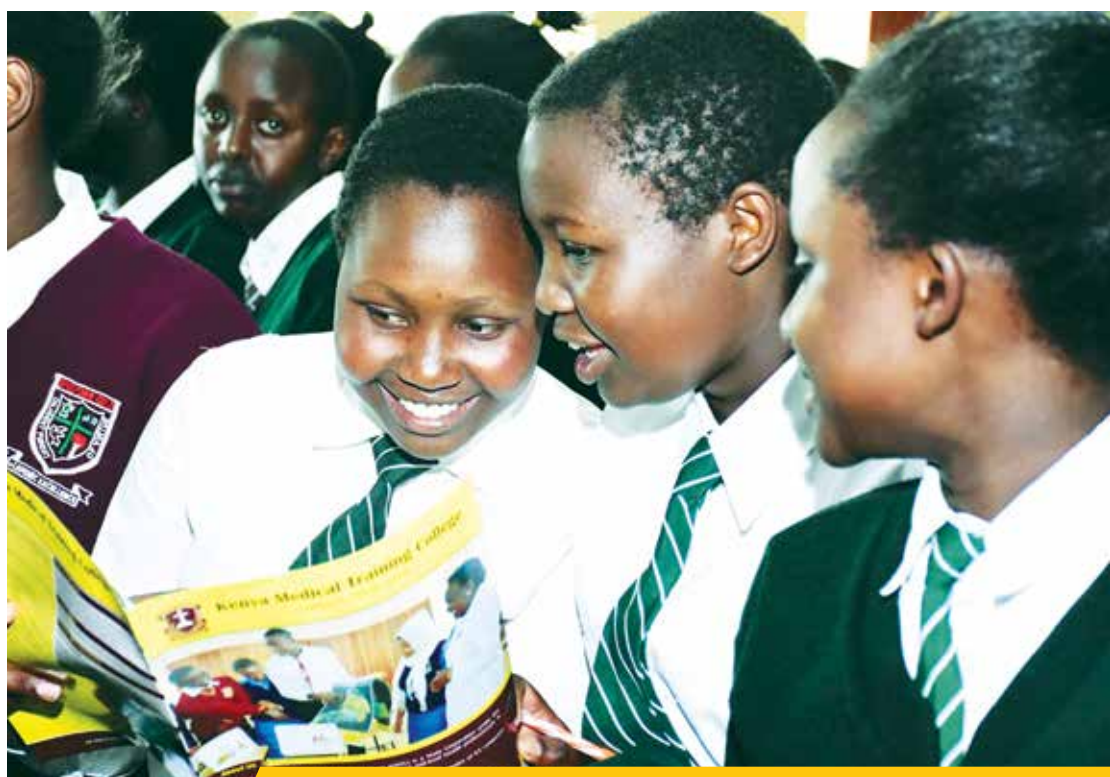
High school students peruse through KMTC brochure during the mentorthon event in Elgeyo Marakwet

As KMTC marketed its courses to the more than 1,000 students in attendance, high profile