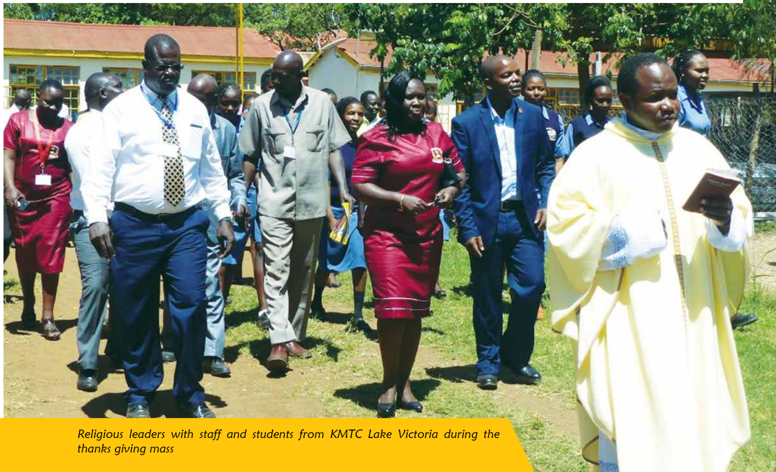
Religious leaders with staff and students from KMTC Lake Victoria during the thanks giving mass

L ake Victoria Campus held a thanksgiving mass on 17 th May, 2019 for the achievements registered in the previous year.