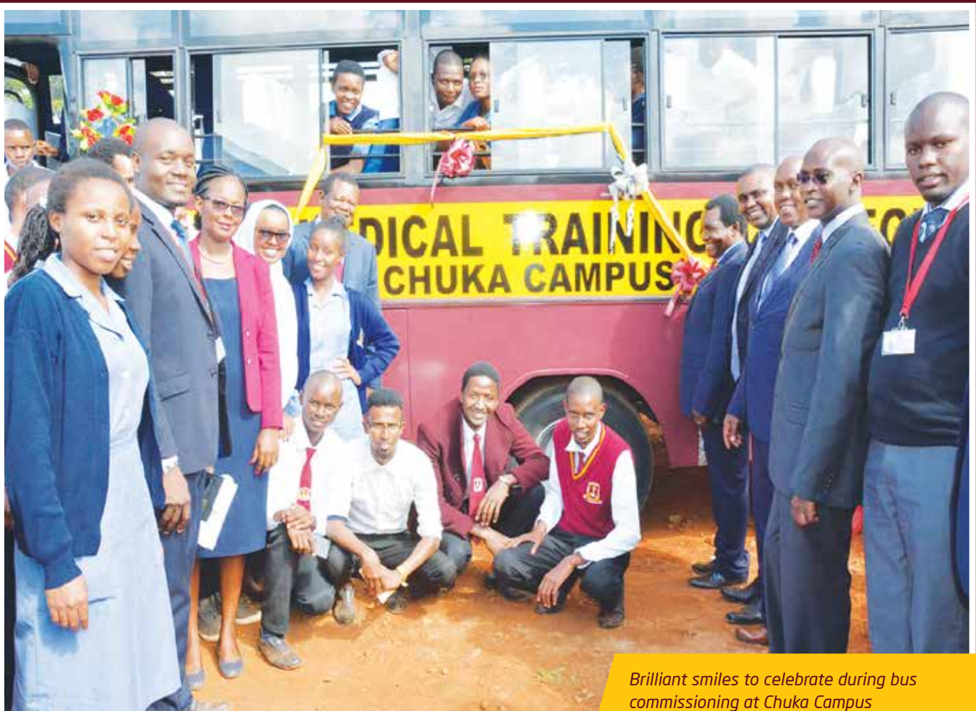
Brilliant smiles to celebrate during bus commissioning at Chuka Campus