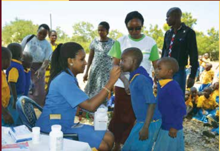
A KMTC Student attends to Pupils During a Free Medical Camp