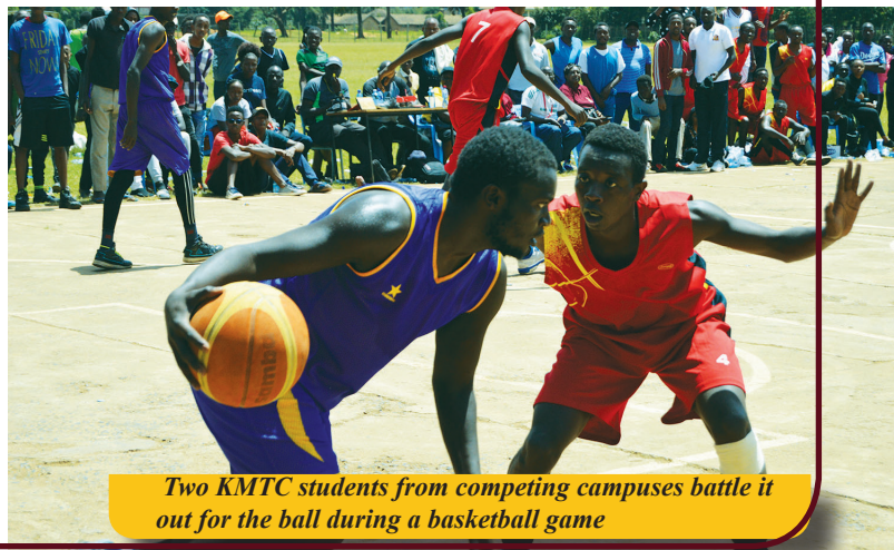
Two KMTC students from competing campuses battle it out for the ball during a basketball game

"Sports bring people together for a common goal creating unity and cohesion" Hon. Kamar