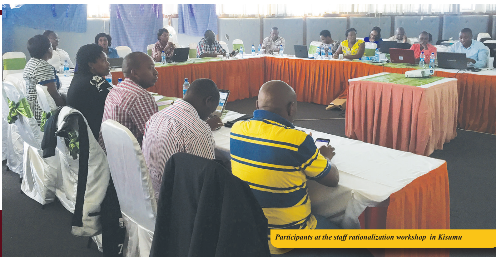
Participants at the staff rationalization workshop in Kisumu

The Kenya Medical Training College held a staff rationalization and regionalization workshop in Kisumu from 7 - 11 January, 2019.