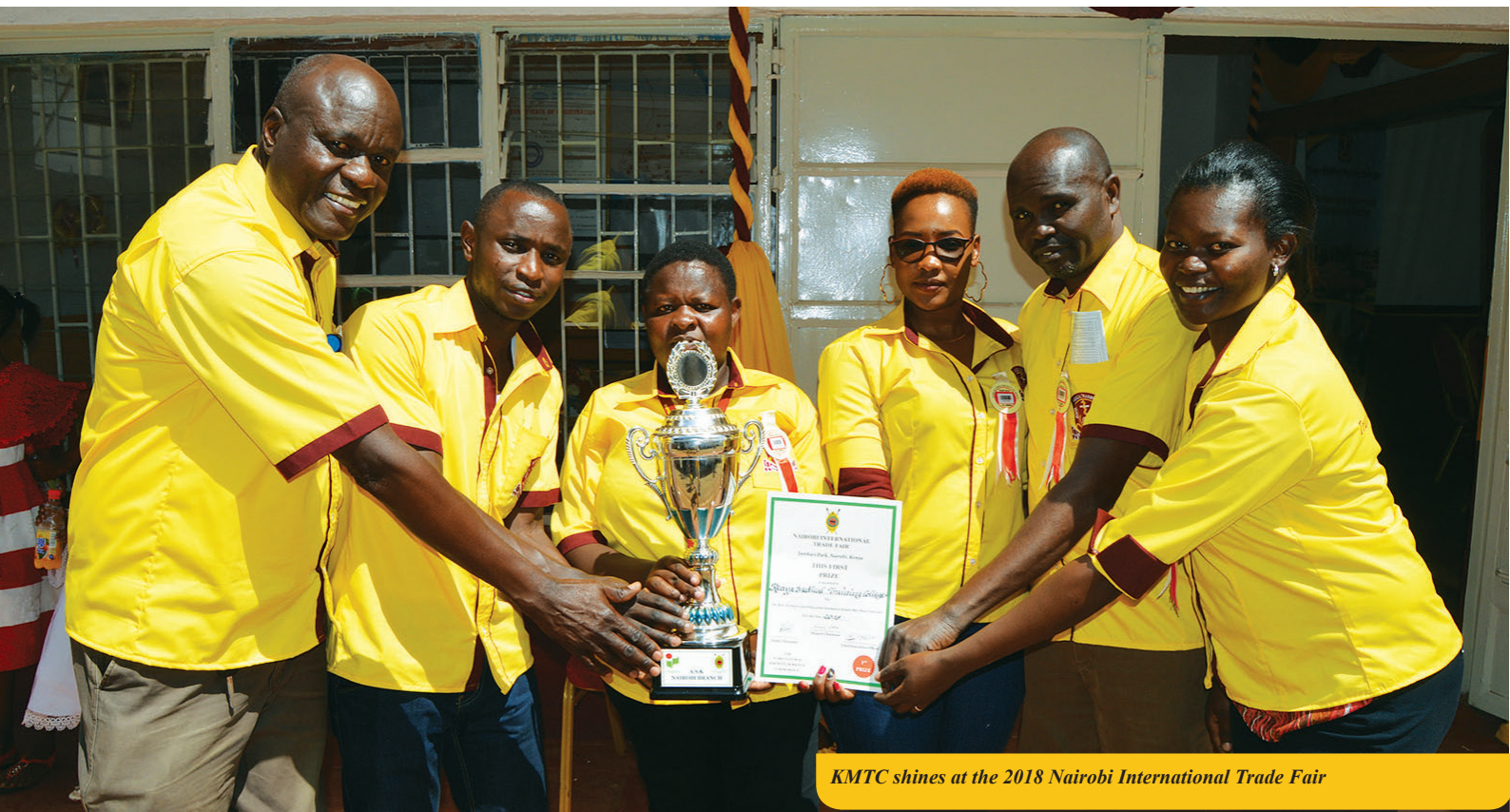
KMTC shines at the 2018 Nairobi International Trade Fair

The Kenya Medical Training College (KMTC) scooped a top award in the category of "Best Tertiary Level Education Institution other than University" during the 2018 Nairobi International Trade Fair held between 1 - 7 October 2018. The College also took the third position in the "Education and/or Research Stand, that Best Interprets Current Show Theme".