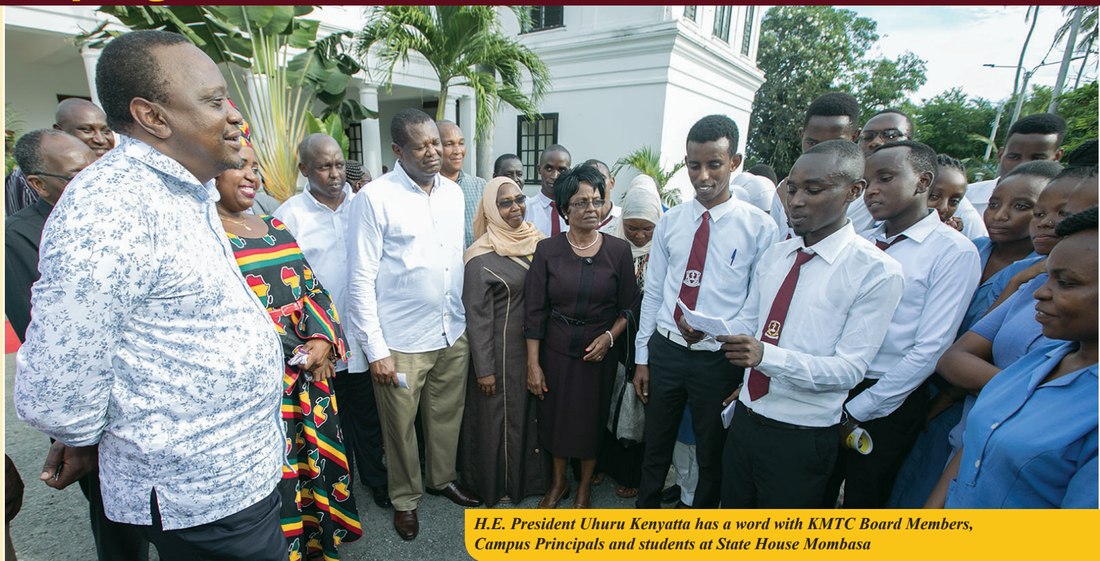
H.E. President Uhuru Kenyatta has a word with KMTCC Board Members, Campus Principals and students at State House Mombasa

H is Excellency President Uhuru Kenyatta on Monday, 19 th November, 2018 met the Kenya Medical Training College (KMTCC) Board of Directors, where he gave Ksh0.5m to the College's Msambweni Campus students' leadership to fulfill his pledge to the kitty for needy students.