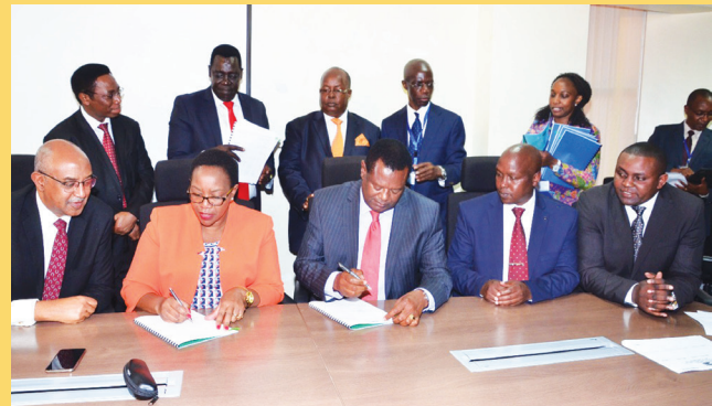
KMTc signs 2018-2019 Performance Contract with Government