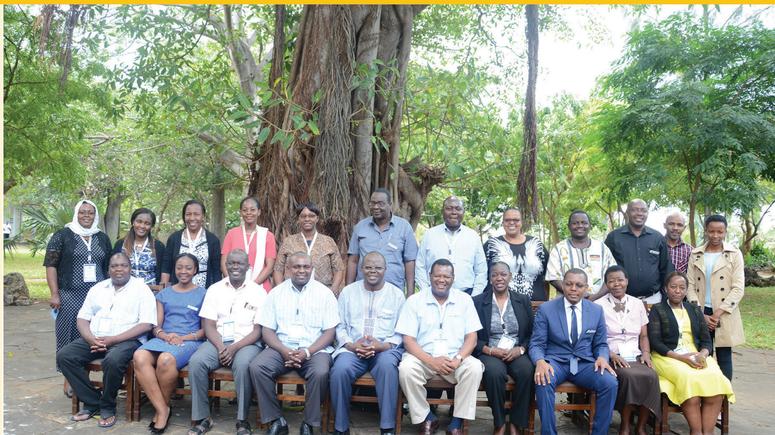
A section of the Board Directors during a past function.

A corporate governance and effective leadership seminar was held for KMTc Board Directors in Mombasa from 1 - 3 October, 2018.