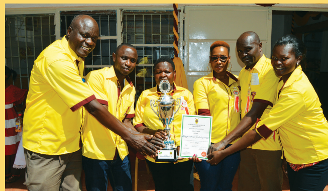
KMTc shines at the 2018 Nairobi International Trade Fair