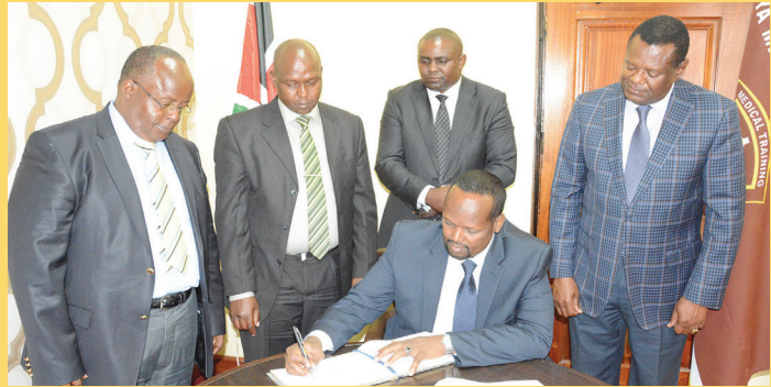
New KMTc Manderla Campus to benefit Kenya and Somalia students