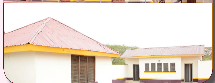
A hostel block at KMTc Mandera funded by the Mandera County Government