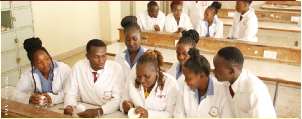
KMTC File Photo: 2022