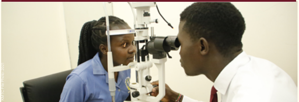
KMTC File Photo: 2021