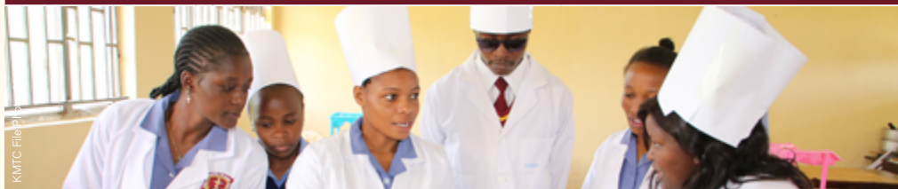
KMTC File Photo: 2019